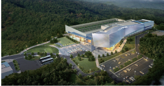
Ongnyeon International Shooting Range