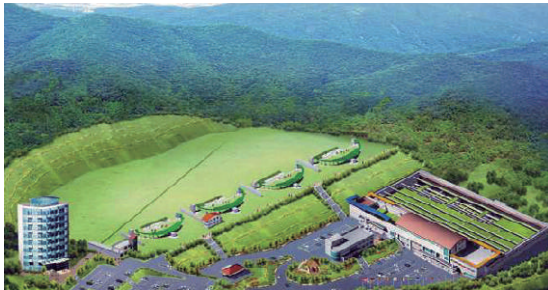
Gyeonggido Shooting Range