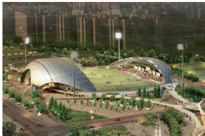
Namdong Asiad Rugby Field

Address Olympic Center, 424 Olympic-ro, Songpa-gu, Seoul, Korea, 138-749 Phone +82 2 2144 8114 Fax +82 2 414 5583 Email koc@sports.or.kr Web www.sports.or.kr