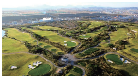
Dream Park Country Club 드림파크 컨트리클럽

Address Olympic Cener, 424 Olympic-ro, Songpa-gu, Seoul, Korea, 138-49 Phone +82 2 2144 8114 Fax +82 2 414 5583 Email koc@sports.or.kr Web www.sports.or.kr