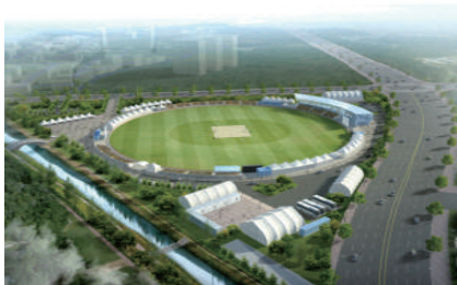
Yeonhui Cricket Ground

Address Olympic Center, 424 Olympic-ro, Songpa-gu, Seoul, Korea, 138-749 Phone +82 2 2144 8114 Fax +82 2 414 5583 Email koc@sports.or.kr Web www.sports.or.kr