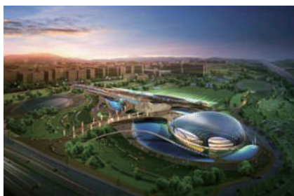
Gyeongang Asiad Archery Field

Address Olympic Center, 424 Olympic-ro, Songpa-gu, Seoul, Korea, 138-749 Phone +82 2 2144 8114 Fax +82 2 414 5583 Email koc@sports.or.kr Web www.sports.or.kr