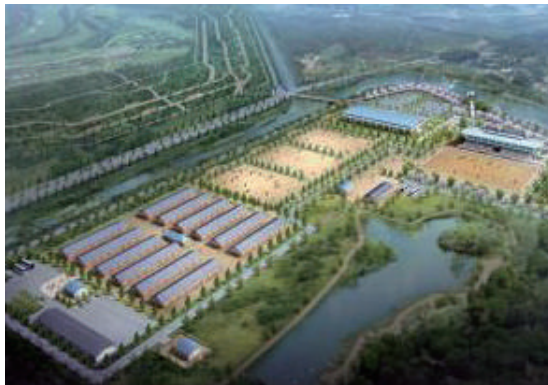
Dream Park Equestrian Venue

The Technical Handbook for Equestrian has been approved by the Asian Equestrian Federation (AEF) on October 21, 2013.