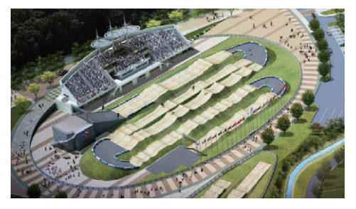
Ganghwa Asiad BMX Track 강화아시아드BMX경기장